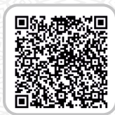
CSE 2025 Mains Reflections