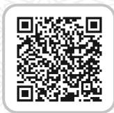
Sample Score Improvement Solution

Our mentorship isn't just about giving feedback—it's about giving the right feedback. You'll be guided by experienced mentors who've helped top scorers in Mains, supported by subject experts who offer targeted advice to improve specific papers. Most importantly, our guidance is based on your actual performance trends—not guesswork. It's smart, strategic, and fully personalised to help you improve where it matters most.