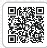
CSE 2025 Toppers Copies