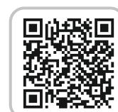
Scan to Enroll MTS 2.0