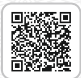
Sample Score Improvement Solution

Our mentorship isn't just about giving feedback—it's about giving the right feedback. You'll be guided by experienced mentors who've helped top scorers in Mains, supported by subject experts who offer targeted advice to improve specific papers. Most importantly, our guidance is based on your actual performance trends—not guesswork. It's smart, strategic, and fully personalised to help you improve where it matters most.