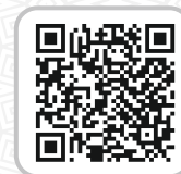
Scan to Enroll MTS 2.0

“A mentor is not someone who teaches you what to do, but someone who helps you understand what you can do.”