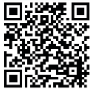
Class Handout Sample