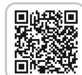
Scan to Enroll MTS 2.0