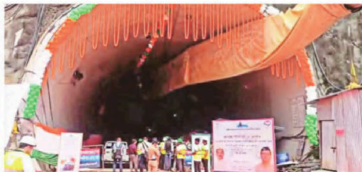
The 4.5-km Silkyara tunnel is being constructed at an estimated cost of ₹853 crore.

"We all remember the unfortunate day of November 12, 2023, when the tunnel collapsed during the construction. The Prime Minister was in contact three times a day. His principal secretary was here. Technology was made available for us. I thank every expert across the country who contributed with their experience. I had announced that a temple of Baba Bhauknath ji will be built, and today, we have conducted the pran pratishtha of the temple," Dhami said at the event.