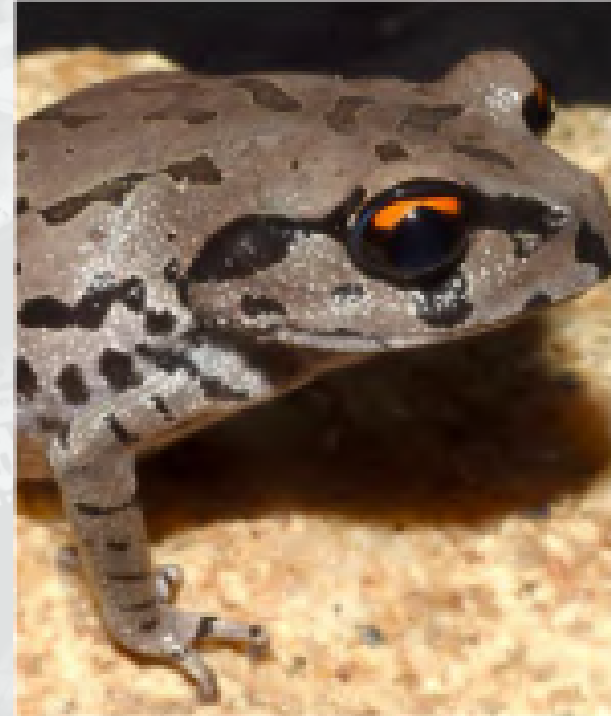
Leptobrachium aryatium , a new-to-science frog recorded from a reserve forest on the edge of Guwahati. SPECIAL ARRANGEMENT

Studied over 21 years, new species of frog named after