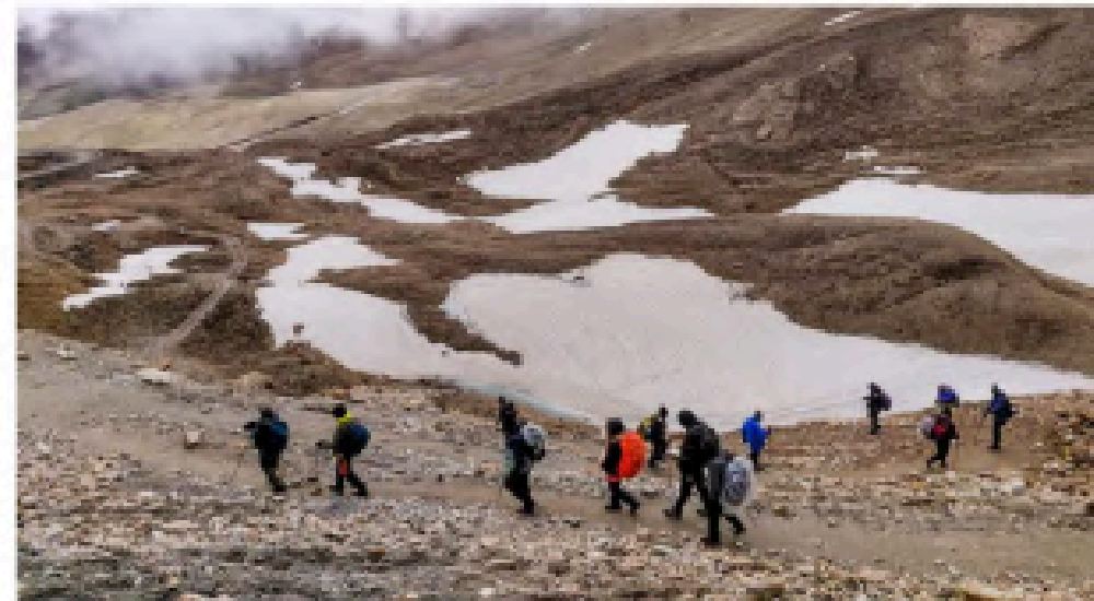
Clearing the way: The Yatra was suspended during the pandemic and had remained so over border tensions.

Sources said that the two sides have discussed the resumption of the pilgrimage in detail in the last few weeks, and expect a breakthrough "shortly".