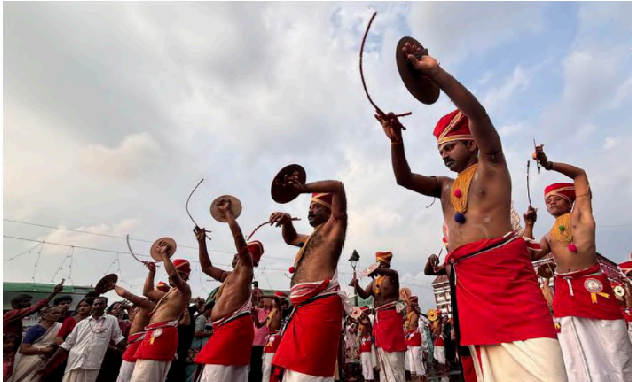
An enactment of Kolkali, depicting the Pandava-Kaurava war from the Mahabharata, performed in front of Sree Radmanabhaswamy.