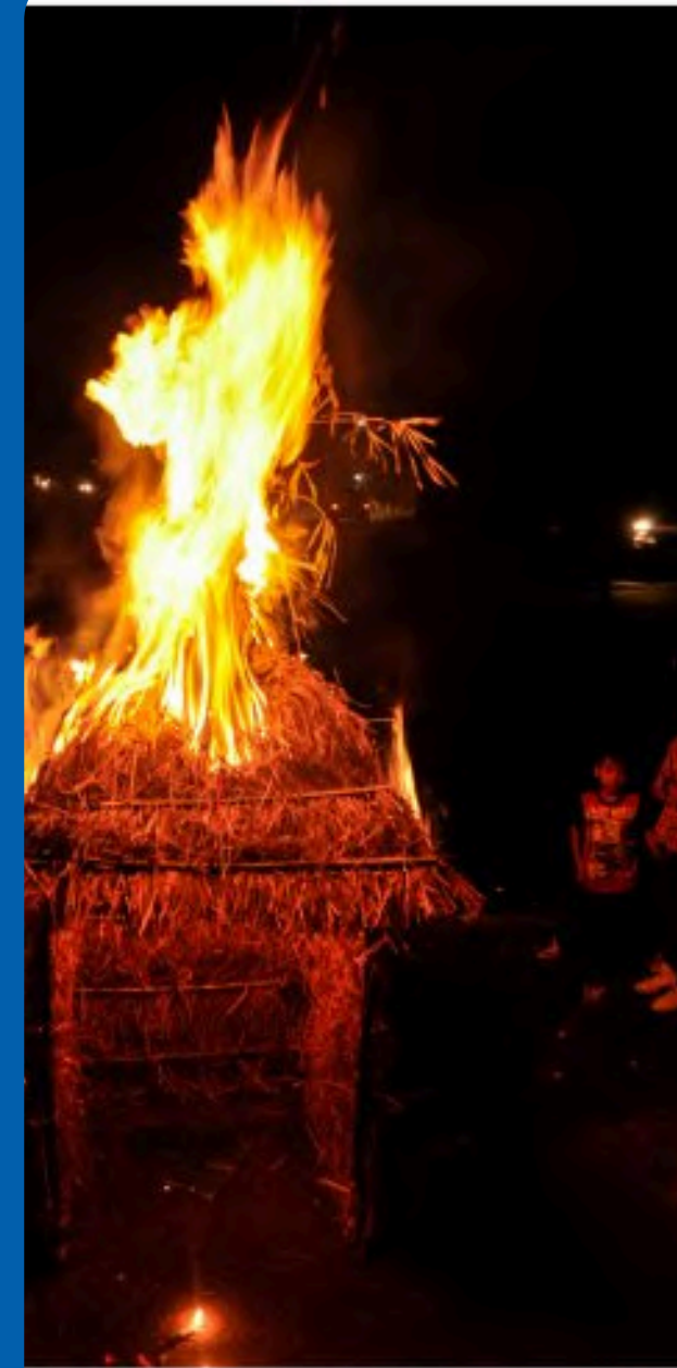
"Yaoshang" marks the beginning of the five-day festival.