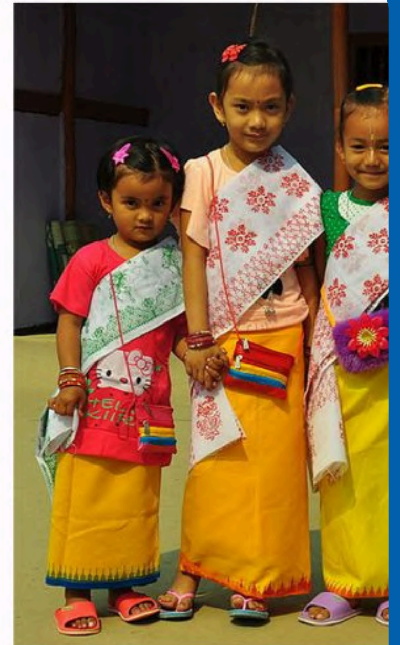
Little girls in traditional attires getting ready for "Nalchak" performance.