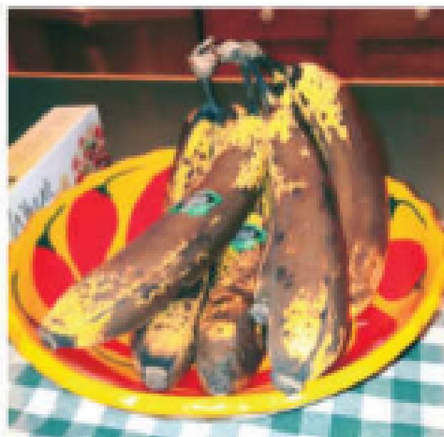
It is natural for bananas to turn brown.

Bananas boast a colourful life cycle — they start at a deep green, change to a delicious yellow, and end (if not consumed beforehand) at an unappetising brown. These changes are a product of their ripening process, which is caused by a