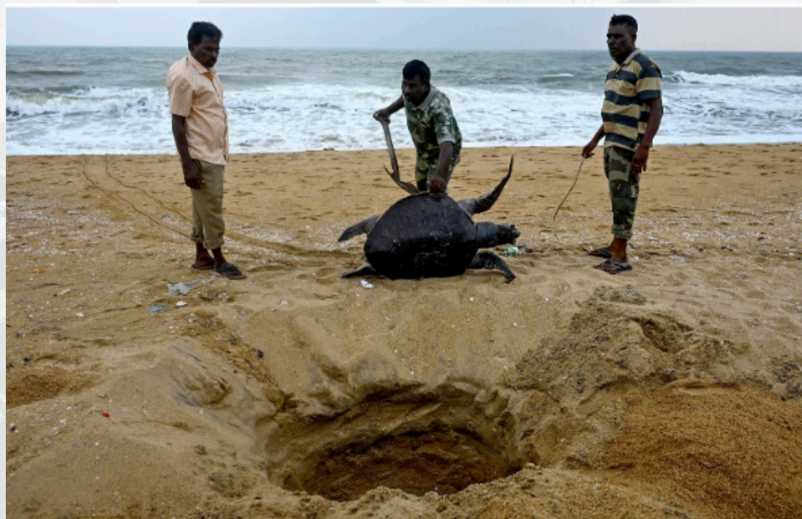
Fisherfolk and people from the Tamil Nadu Forest Department bury a dead Olive Ridley turtle that was washed ashore.