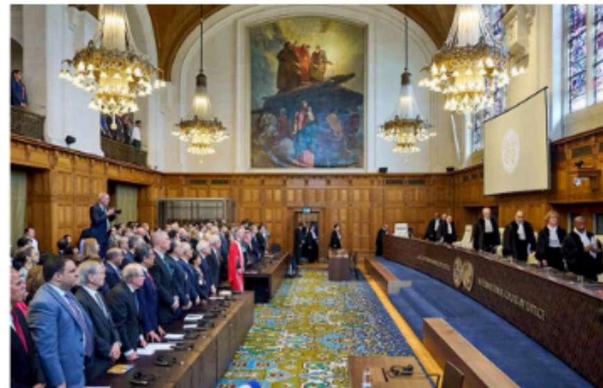
Behavioural pattern: Previous sanctions by the U.S. under President Donald Trump had targeted the court's prosecutor.

Mr. Trump signed an executive order on Thursday saying the court in The Hague had "abused its power" by issuing an arrest warrant for visiting Israeli Prime Minister Benjamin Netanyahu, who held talks with the U.S. President in