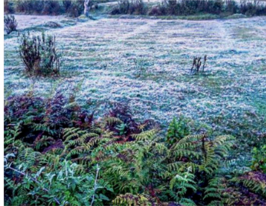
Icy mornings: A frost-covered grassland at Chenduvurai near Munnar in Idukki on Friday morning.

According to climatologist Gopakumar Choleyil, the hill station might have