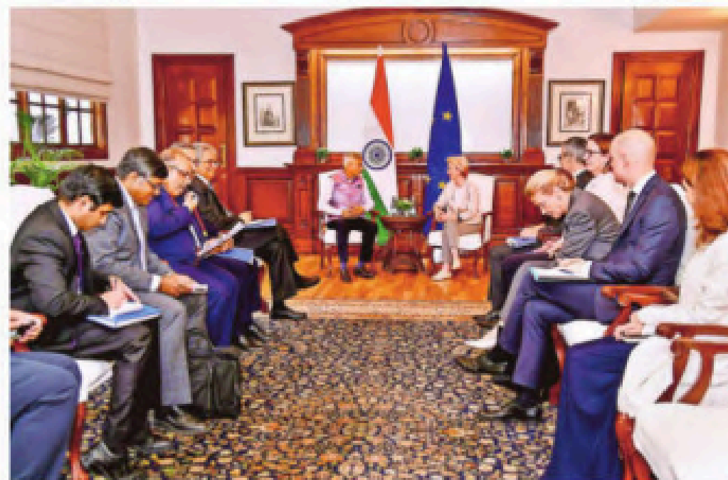
External Affairs Minister S Jaishankar during a bilateral meeting with European Commission President Ursula von der Leyen in New Delhi on Thursday.

These include artificial intelligence (AI) and semiconductors, as well as green hydrogen, sustainable urbanisation, water management, resilient supply chains, de-