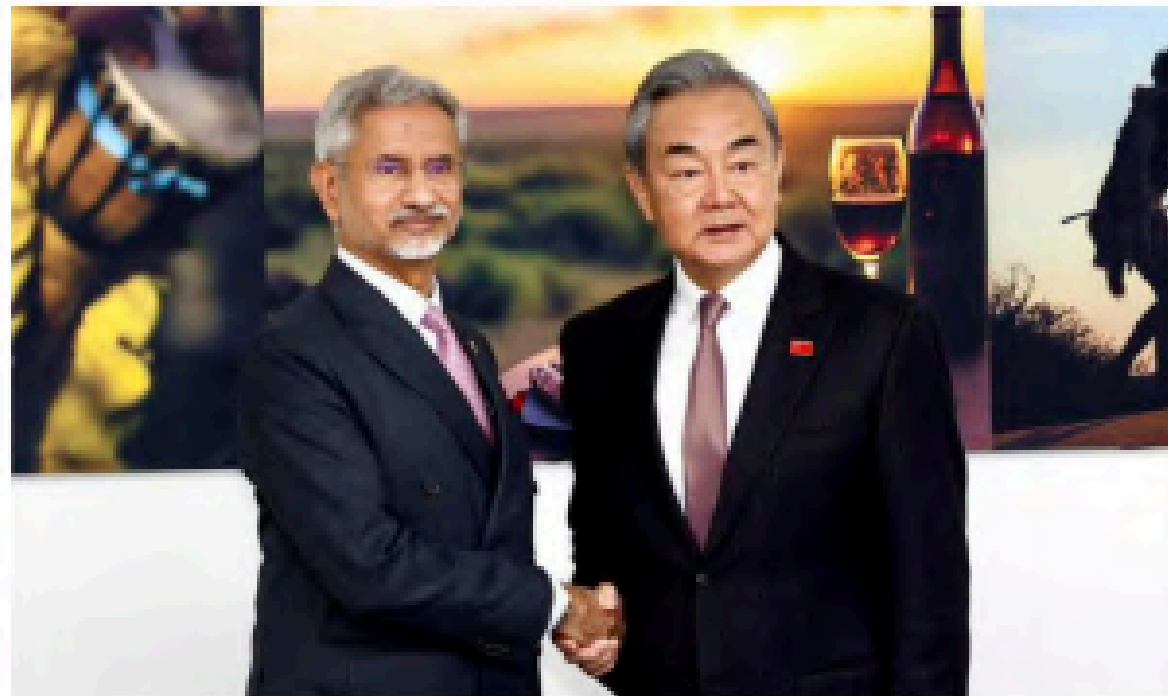
Looking ahead: External Affairs Minister S. Jaishankar with China's Foreign Minister Wang Yi in Johannesburg.

In the half-hour-long meeting where they discussed bilateral developments, including the situation on the Line of Actual