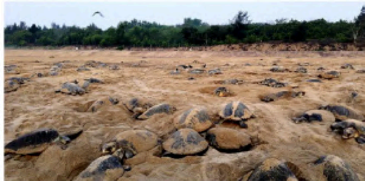
Mass congregation: Olive Ridley turtles are seen at the Rushikulya beach in Ganjam district of Odisha.

“During 2023-24 and 2024-25, only sporadic nestings were noticed along Rushikulya. The last