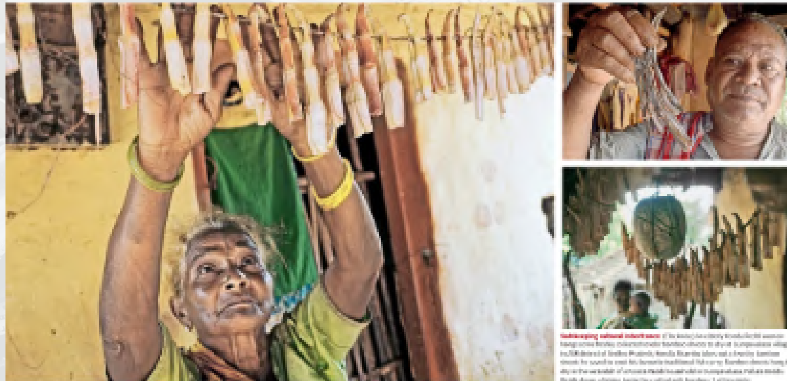
Preserving, cultural heritage In the biodiversity-rich Kodagu district, bamboo shoots are a staple food. In the Kodagu district, bamboo shoots are a staple food. In the Kodagu district, bamboo shoots are a staple food.