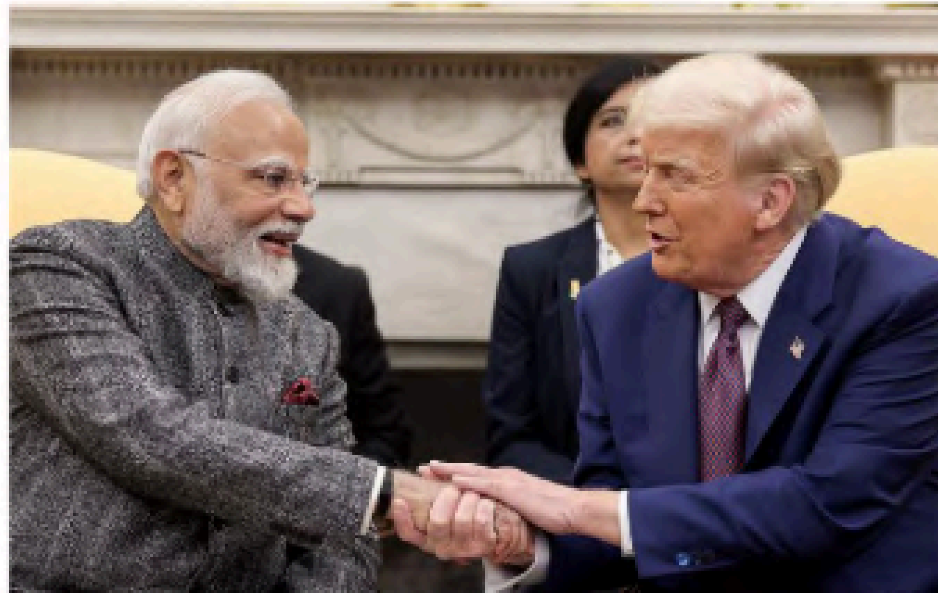
Power point: Prime Minister Narendra Modi with U.S. President Donald Trump during a meeting at the

Mr. Trump announced that his administration had cleared the way for the extradition of Tahawwur Rana, wanted in India in con-