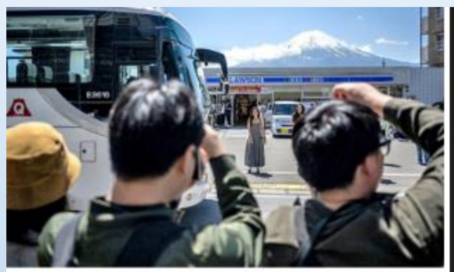
Tourists take pictures with Mount Fuji in the backdrop in the town of Fujikawaguchiko, Japan on Friday.

Japan town to block Mt. Fuji view from 'menacing' tourists