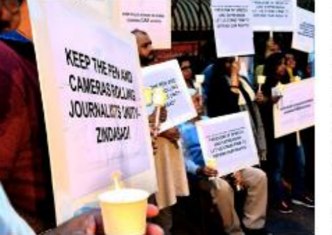
Press freedom fell by an average 7.6 points globally, according to the index put out by Reporters sans Frontières. FILE PHOTO

"Press freedom around the world is being threatened by the very people who should be its guarantors - political authorities," the RSF said, noting that press freedoms fell by