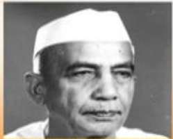
Chaudhary Charan Singh