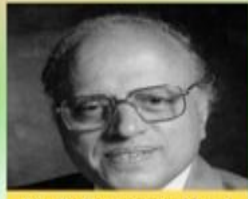
M. S. Swaminathan