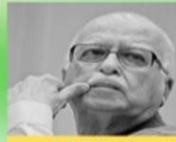
L K Advani