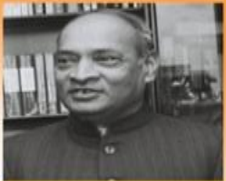
P V Narasimha Rao