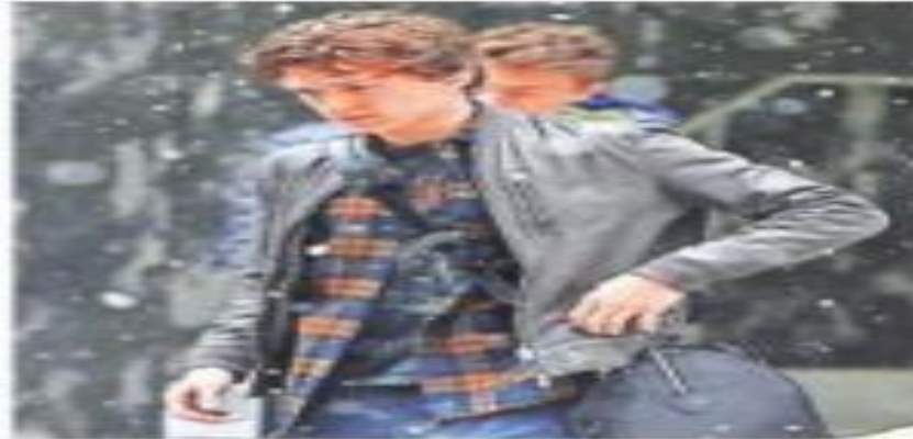
Actor Tom Holland contributed to the popularity of the word 'rizz'.