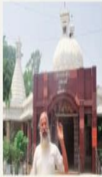
The Punaura Dham temple.

They later travelled by bullock cart to the confluence of Ganga and Son near Patna (Patna). The Son-Ganga confluence course has shifted away from Patna over the years.