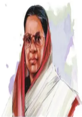
JUSTICE FATHIMA BEEVI