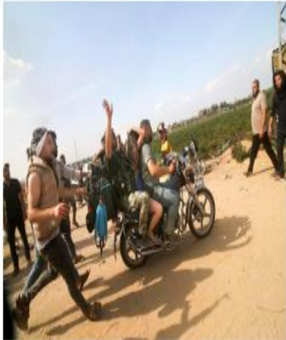
Bargaining chip: Palestinians transport a captured Israeli civilian, centre, into the Gaza Strip on Saturday.

"We have decided to put an end to all of the occupation's crimes. The time is over for them [Israel] to [continue to] act without accountability," said Mohammad Deif, the shadowy commander of al-Qasam Brigades, Hamas's military wing, on October 7. His audio statement was telecast on TV after Hamas launched an unprecedented